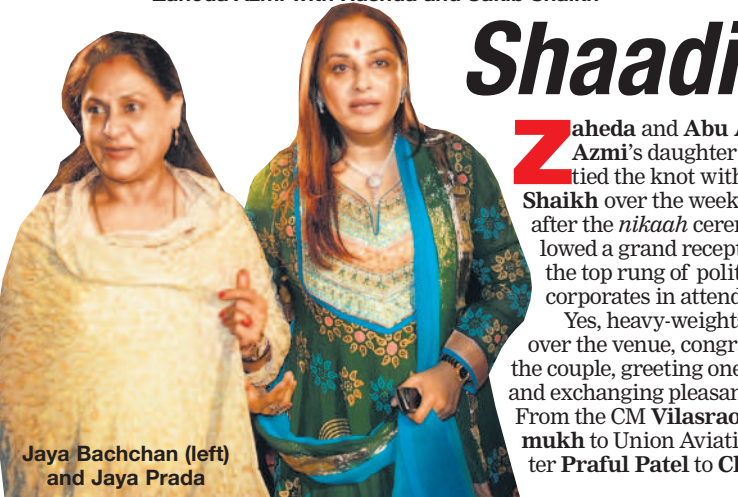
Jaya Bachchan (left) and Jaya Prada